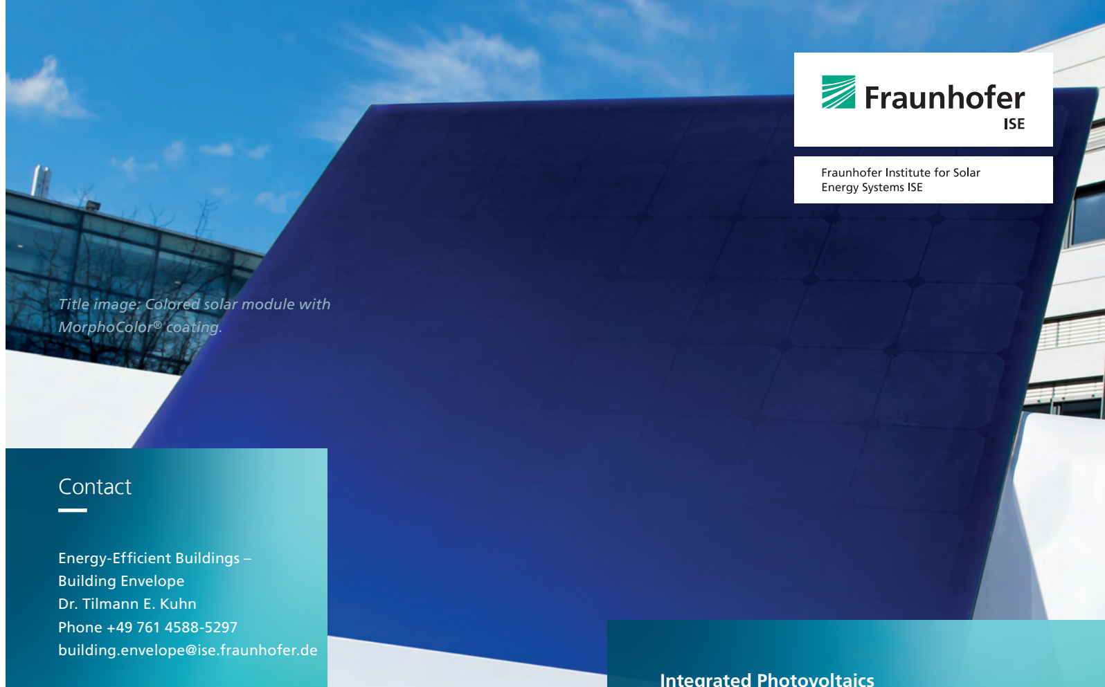
Title image: Colored solar module with MorphoColor® coating.

Building-integrated PV and its role in the energy transition Fraunhofer ISE is working together with industrial partners on a number of flagship BIPV projects. At our “Module-TEC – Module Technology Evaluation Center” we are producing different samples and prototype batches using our own industrial facilities. In our TestLabs for “Solar Façades” and “PV Modules”, which are accredited according to DIN EN ISO 17025, we test the electrical, thermal and optical properties of multifunctional BIPV construction components, as well as the quality and reliability of these modules and systems.